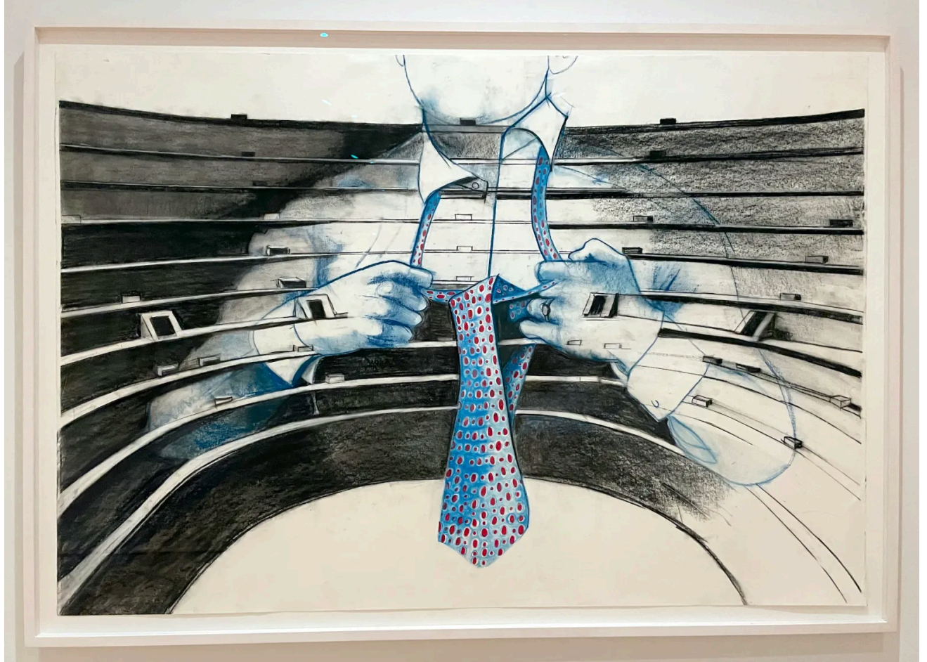
Ericka Beckman, "Tension Building Concept Drawing" (2015), charcoal, graphite, felt-tip pen, and pastel on paper

“Visually, [Beckman’s] schematic images are closer to Russian Constructivism and even some of Giorgio de Chirico’s metaphysical paintings than to anything from 1980s New York.” — NH