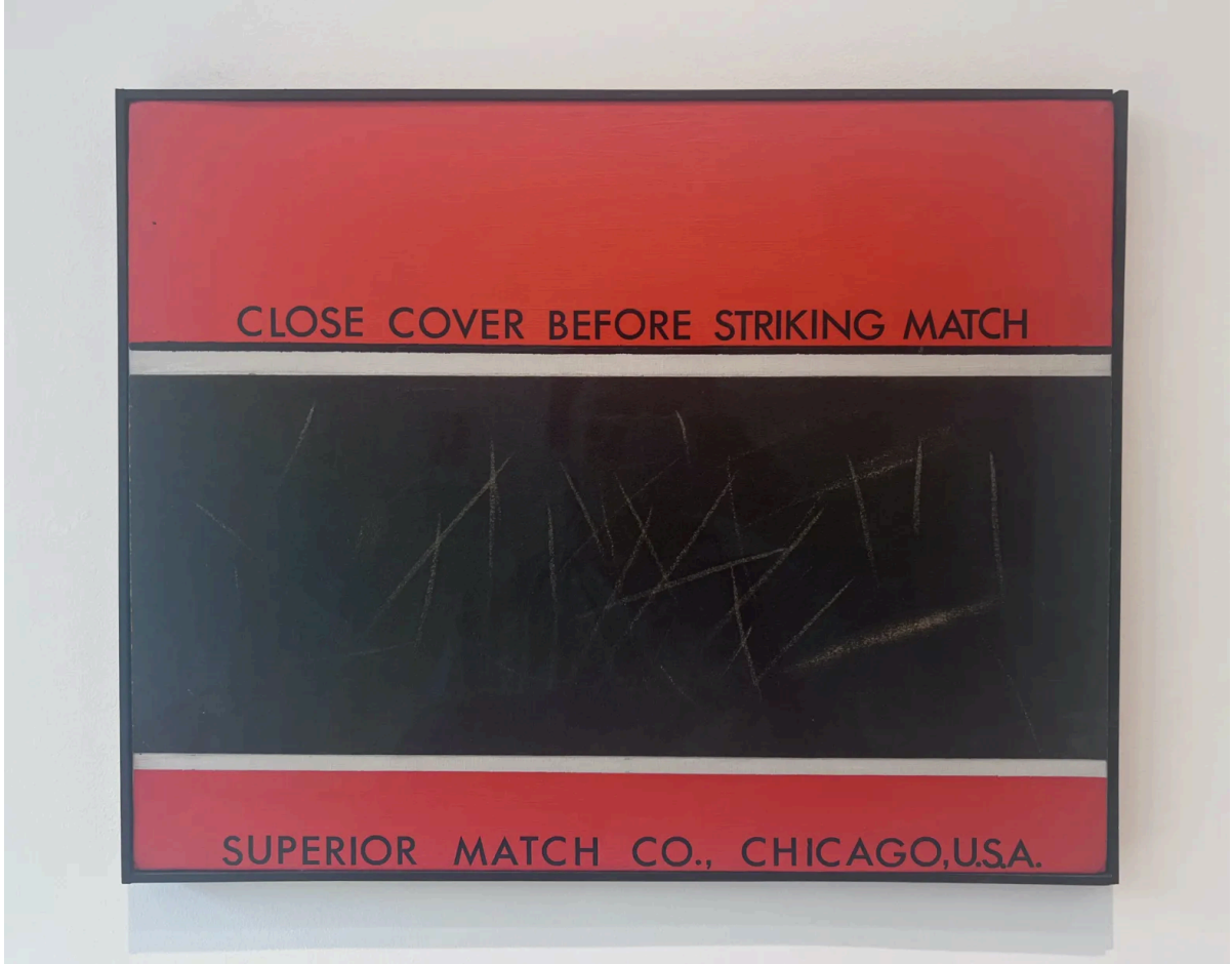
Andy Warhol, "Close Cover Before Striking" (1962), acrylic and collage on linen

“The exhibition is relatively straightforward — though no less rich and evocative for it — asking and suggesting answers to the question: What is the relationship of language and silence to visual art?” — Lisa Yin Zhang