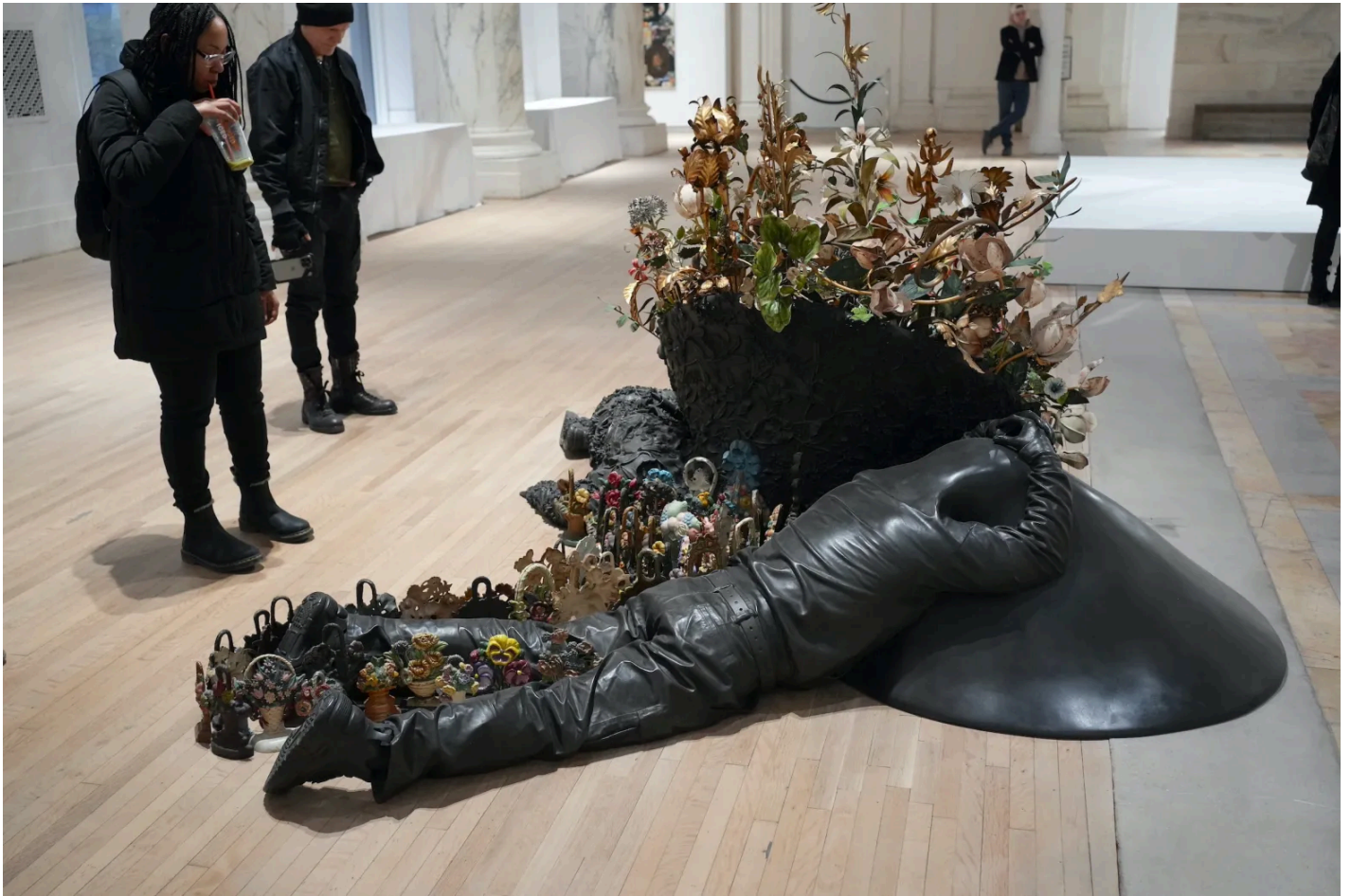
Nick Cave, “Amalgam (Plot)” (2024), bronze, tole flowers, and cast iron door stops, on view at Jack Shainman Gallery