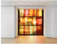
Spencer Finch Candlelight (CIE 529/418) , 2022 Stained glass, steel frame Dimensions variable