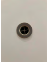
Robert Gober Drains , 1990 Cast pewter 3 3/4 × 3 3/4 × 1 5/8 inches (9.5 × 9.5 × 4.1 cm)