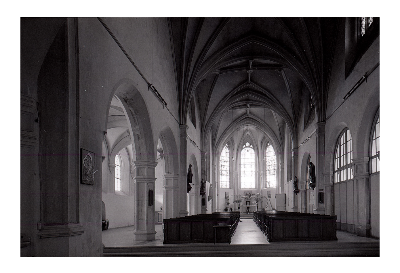
Priory church of Saint-Firmin, Flavigny-sur-Moselle, interior of choir.