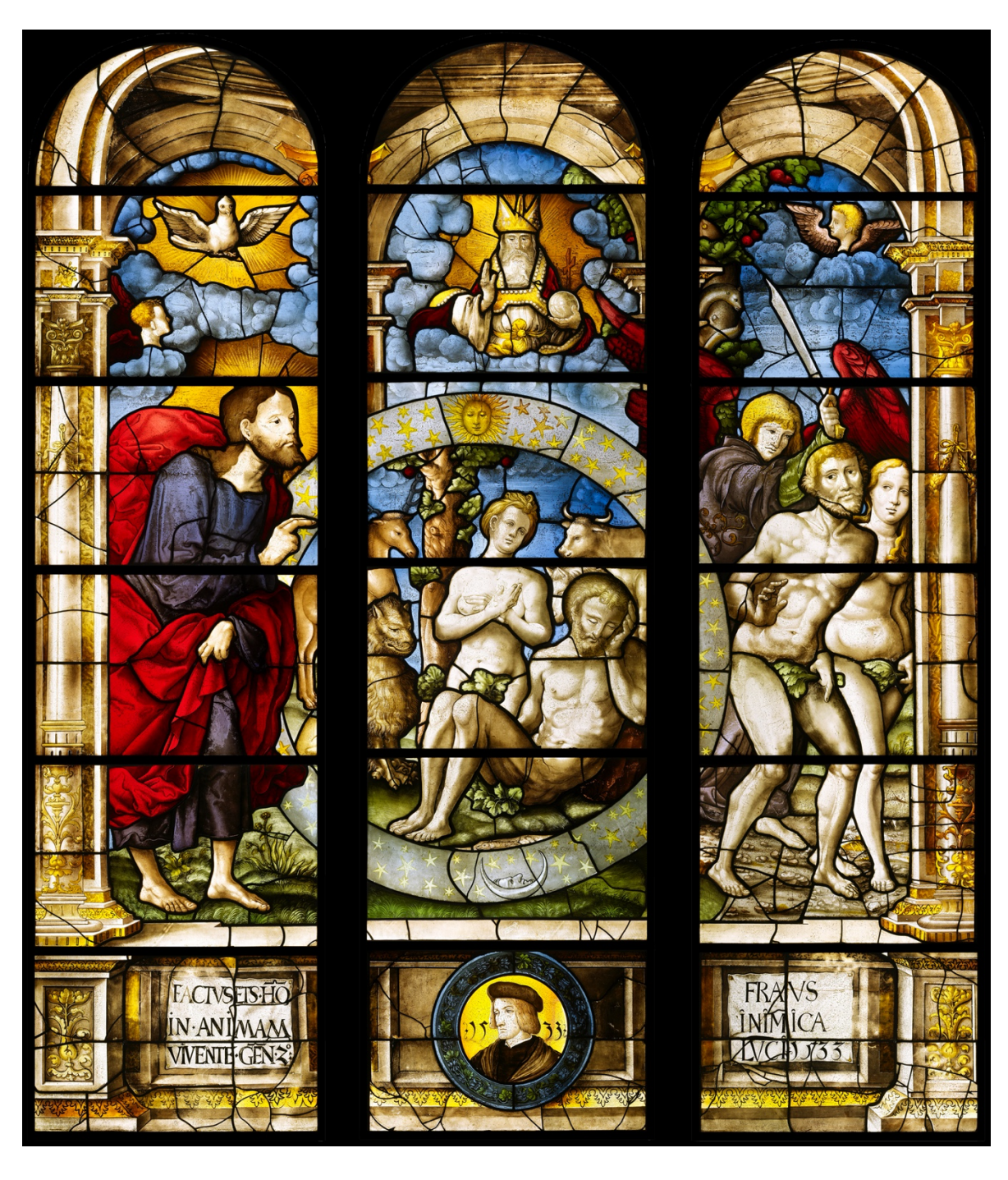
Valentin Bousch, The Creation and the Expulsion from Paradise , 1533. Green, red, purple, blue and clear glass with silver stain and vitreous enamel, 114 x 90 inches (289.6 x 228.6 cm).